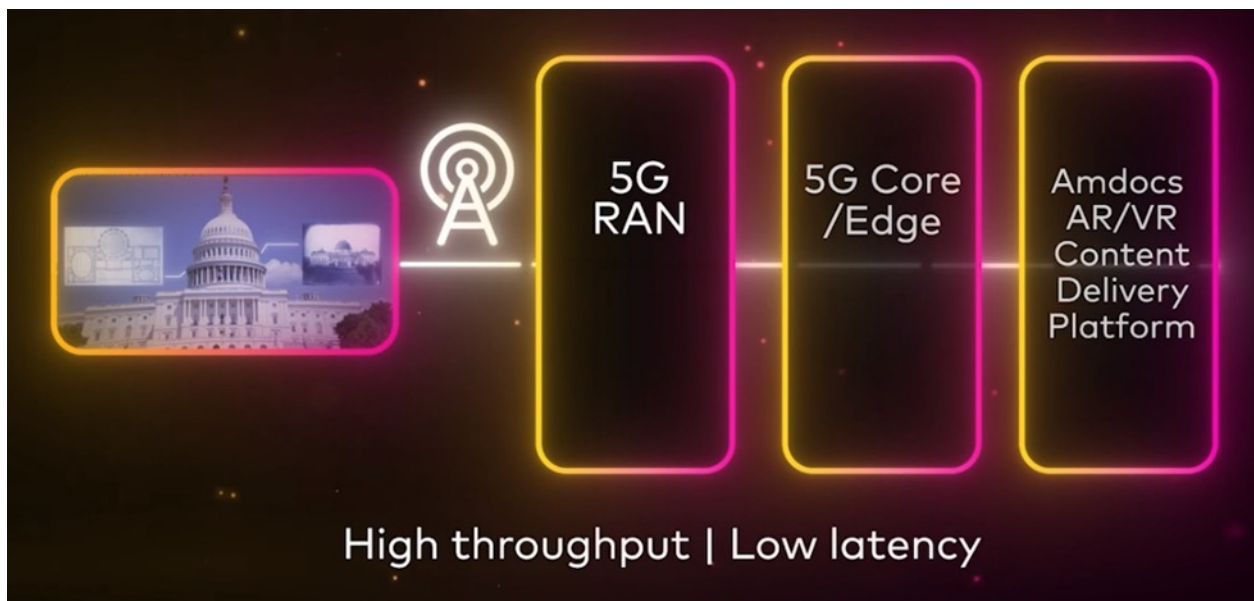
Amdocs Private Networks Single Pane of Glass Connecting All

Our services encompass network planning, deployment and management.