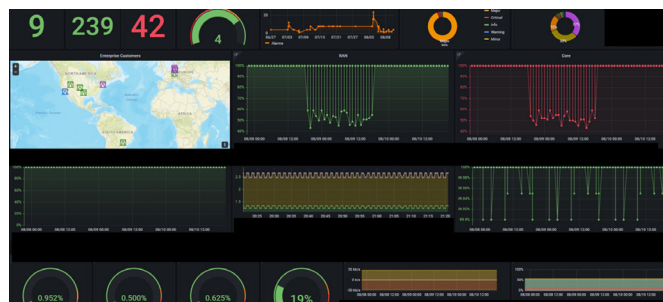
Mobile Private Network End-to-End Management Portal